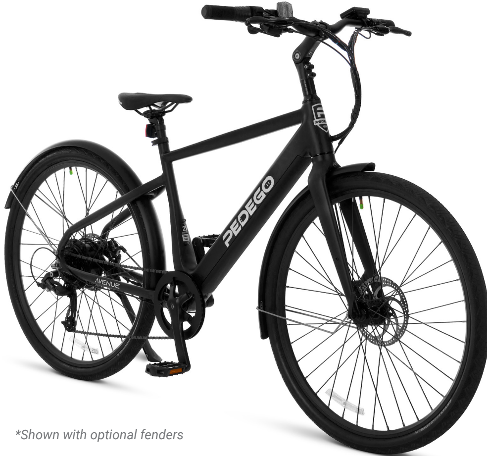
*Shown with optional fenders

The Pedego Avenue is simplicity itself. Its minimalist design has everything you need and nothing you don't.